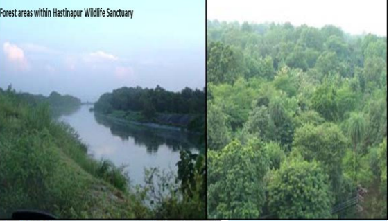
Forest areas within Hastinapur Wildlife Sanctuary