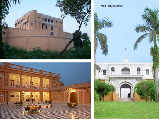
Mud Fort, Kuchesar