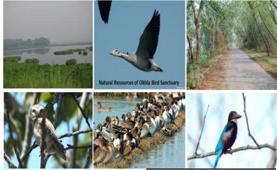
Natural Resources of Okhla Bird Sanctuary