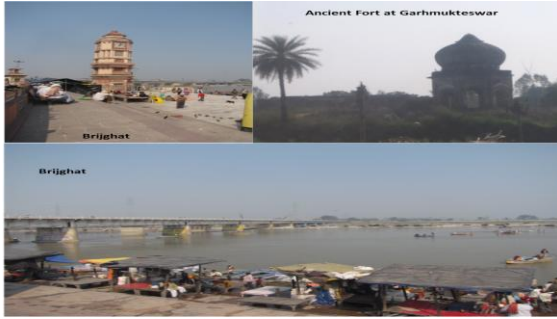
Ancient Fort at Garhmukteswar